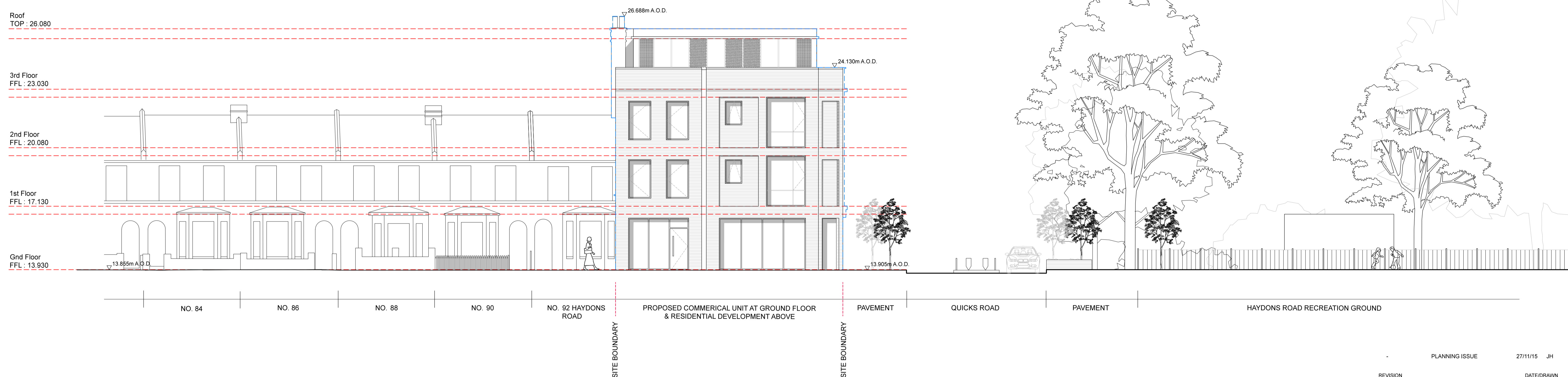
Proposed East Elevation (Haydons Road)